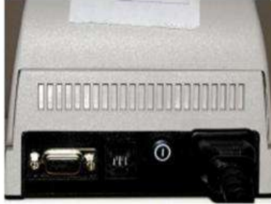
Figure 3 Location of the Serial connector on the PCNEOS printer (to the left).