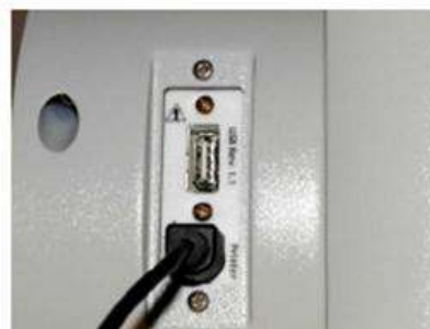
Figure 2 Connecting the Printer cable to the NucleoCounter (lower connector).