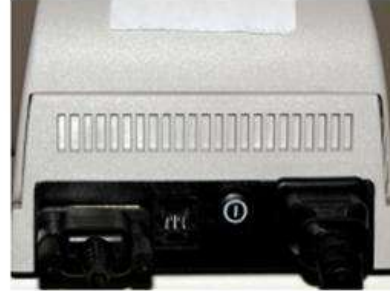
Figure 4 Connecting the Printer cable to the PCNEOS printer.

The Printer output on the NucleoCounter is on the left hand side of the instrument when seen from the rear (see Figure 1). Please note that the Printer output is the circular shaped connector below the USB connector.