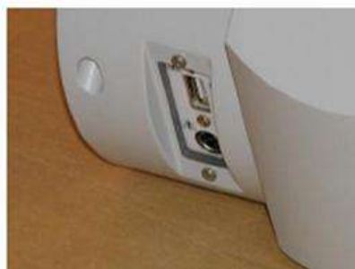
Figure 1 Location of the Printer output on the NucleoCounter